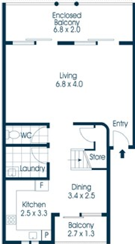
Elevated Ground Floor