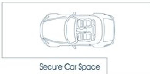
Secure Car Space